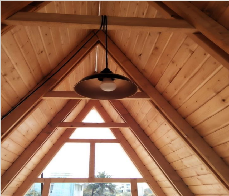
MATERAIL USED FOR WOODEN HOUSE