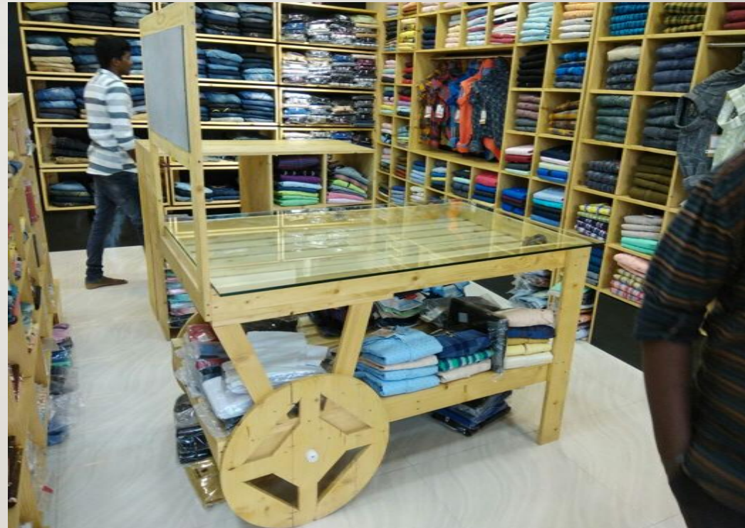
PLANKS USED FOR INTERIOR WORKS